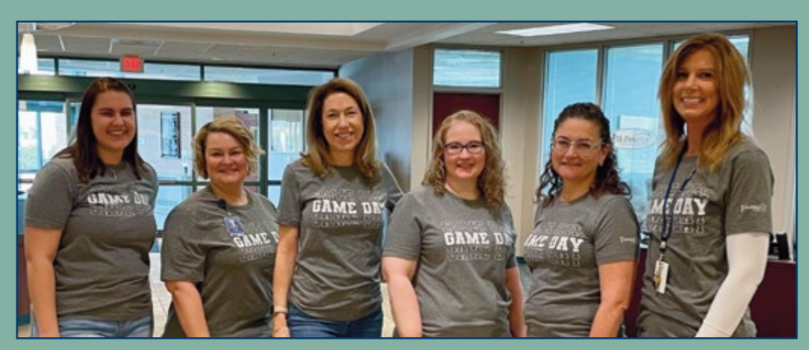
Team members sported Game Day shirts to support our local high school teams.