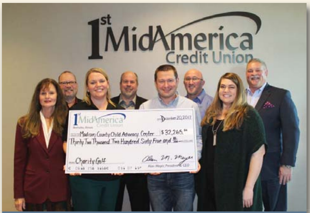
Check presentation to the Child Advocacy Center of $32,265