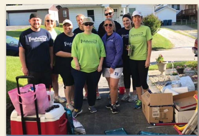
Painting a local home during the annual Bucket Brigade

Community team enjoying a walk in the Bethalto Memorial Day Parade