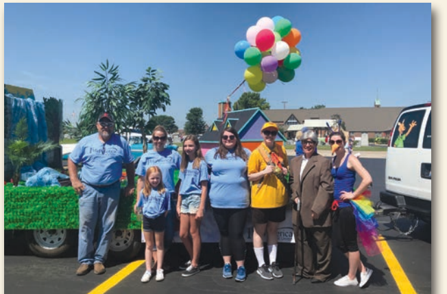
Community team members in Bethalto's 150th Anniversary parade