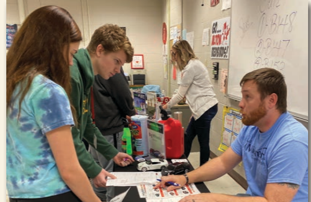
Mad City budget simulation station in local high school