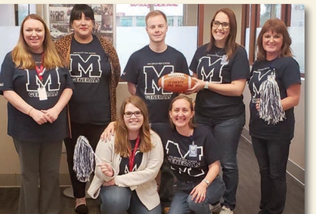
Decatur team cheers on the local high school football team

Community team supporting the Blue Springs Fall Festival